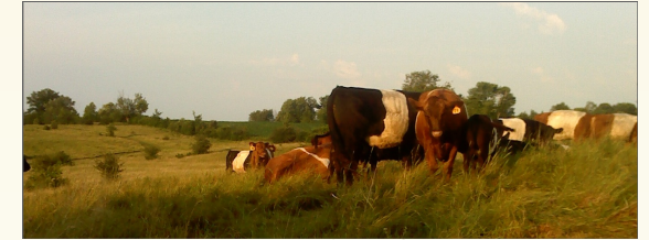
Our contented cattle graze

For a small fee, we deliver to drop-off sites in the Minneapolis/St. Paul metro area. (Demand for grass-fed meats continues to grow. In the event local demand outstrips our supply, we will contact you for your preference: refund your deposit (minus the credit card fee) or credit it to next year's harvest.